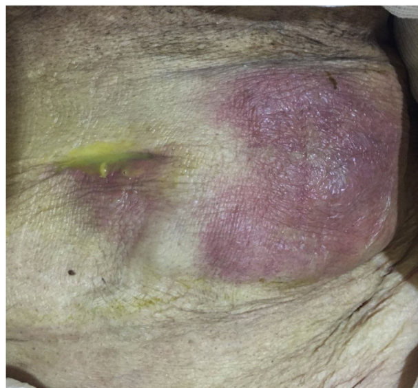
Figure 1 Anterior wall of the abdomen, with the presence of exudate.

cm defect; and the presence of a cholecystocutaneous fistula at the level of the umbilicus (Fig. 2). Fistulectomy was performed and no stones were observed (Fig. 3). The aponeurosis was closed, employing tension, and the use of prosthetic material was ruled out due to the type of intervention. A carbapenem was administered during the postoperative period, and given the patient's favorable progression, she was released.