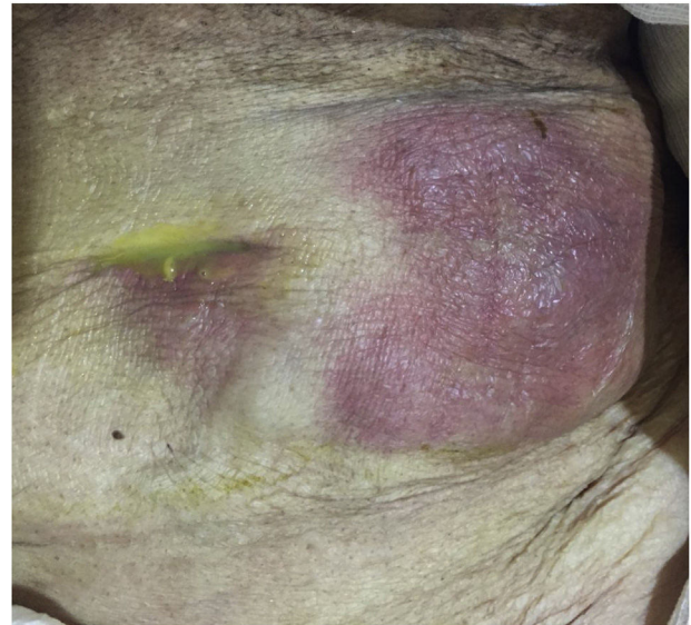
Figure 1 Anterior wall of the abdomen, with the presence of exudate.

cm defect; and the presence of a cholecystocutaneous fistula at the level of the umbilicus (Fig. 2). Fistulectomy was performed and no stones were observed (Fig. 3). The aponeurosis was closed, employing tension, and the use of prosthetic material was ruled out due to the type of intervention. A carbapenem was administered during the postoperative period, and given the patient's favorable progression, she was released.