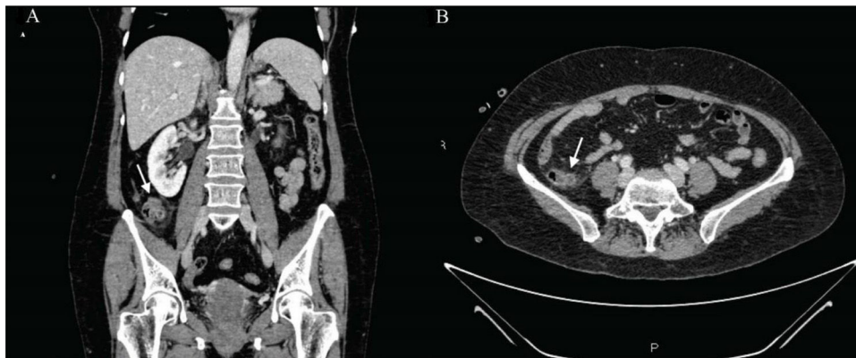
Figure 1 (A) and (B) Coronal and axial views of abdominal CT scans with intravenous contrast medium, showing a diverticular formation of approximately 11 mm in the terminal ileum, with inflammatory changes in the adjacent fat and adjacent layers of free fluid, suggestive of diverticulitis.

With the exception of Meckel's diverticulum, the presence of diverticula in the ileum is a rare entity. Its incidence in the general population varies from 0.3 to 2.3%, according to the most recent case series 1 . Its pathogenesis is attributed to herniation of the mucosa and submucosa, through the intestinal muscle layer, due to local increases in intraluminal pressure and smooth muscle anomalies. The majority of cases (60%) tend to be asymptomatic. When symptoms are present (40%), only a small portion of those cases (10%) develop severe complications. The main complication is diverticulitis, but bleeding and intestinal obstruction can also manifest 2 . The delayed diagnosis of diverticulitis can result in intestinal perforation. Endoscopic access to the ileum and its visualization through conventional imaging techniques are difficult, making the diagnosis of diverticula at that site challenging, and they are often detected intraoperatively 2,3 . There is no clear consensus on their therapeutic management. Even though intestinal resection with primary anastomosis appears to be the