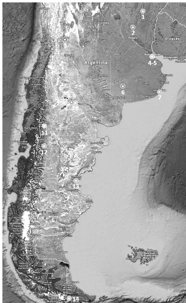
Figure 1 Distribution of the Argentinian sites that participated in the study.

Patient characteristics and comorbidities are detailed in Table 1. The median time interval from NAFLD diagnosis to inclusion in the study was 12.2 (3.0–36.5) months. A total of 126 (53%) patients were men, and the median patient age was 56 years (47–63). All patients had at least one risk factor for NAFLD. Dyslipidemia, obesity, and diabetes were registered in 175 (73%), 134 (59%), and 73 (31%) patients, respectively. Regarding social determinants, most of the patients lived in urban areas, were employed, had at least completed primary school, and had healthcare insurance.