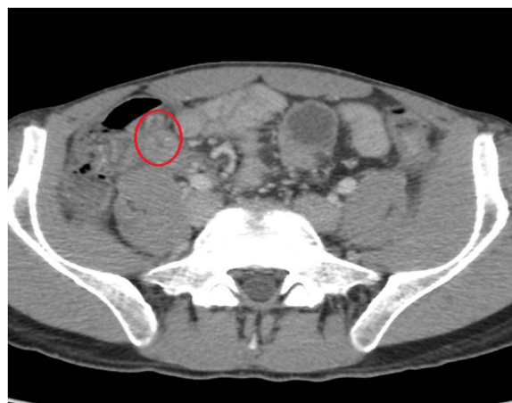
Figure 1 CAT scan image.

A 27-year-old man came to the emergency room due to 24 h epigastric abdominal pain radiating to the right iliac fossa. Upon physical examination, the Blumberg sign was positive and laboratory test results showed leukocytosis with neutrophilia. An abdominal CT scan revealed a post-ileal appendix with thickened walls in which small diverticula were identified (fig. 1, red circle). There were inflammatory changes and a small quantity of fluid in the periappendiceal fat, alterations consistent with appendiceal diverticulitis associated with acute appendicitis. Appendectomy was performed and multiple diverticula, with microperforation in the proximal third of one of them (fig. 2, yellow arrow), were confirmed in the anatomopathologic study. Appendiceal diverticulitis is an uncommon cause of acute abdomen and is clinically indistinguishable from acute appendicitis. On occasion it can be differentiated due to a more indolent course and certain aspects of its epidemiology and progression. Although CT images can be very suggestive of the