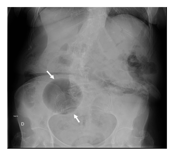
Figure 1 Plain abdominal x-ray identifying a localized, rounded, radiolucent structure in the RIF (arrows).

Servicio de Radiodiagnóstico, Hospital Universitario Central de Asturias, Oviedo, Asturias, Spain