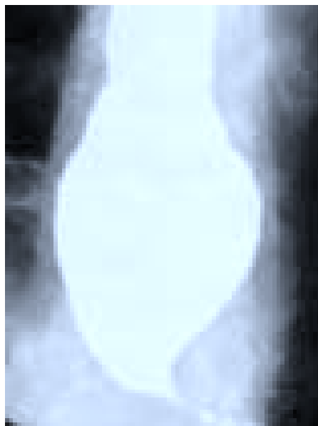
Figure 1. Classic “bird’s beak” appearance of distal esophagus.

present in all achalasia patients. Esophagogastroduodenoscopy (EGD) and barium contrast radiographs of the esophagus and stomach help to define anatomic complications such as ulceration, stricture, malignancy, hiatal hernia, or foreshortened esophagus and thus aid in ruling out the diagnosis of pseudoachalasia. Barium esophagram usually will reveal loss of primary peristalsis and tapering of the lower esophagus which often resembles a “bird’s beak” ( Figure 1 ). Although not performed routinely, esophageal pH monitoring objectively records the frequency and duration of gastroesophageal reflux, and event recording correlates symptoms with reflux episodes.