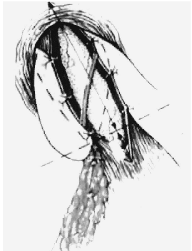
Figure 5. Partial posterior fundoplication with fundus secured to cut edges of myotomy (from reference #9, with permission).

Laparoscopic Heller myotomy and fundoplication is a safe operation when performed by an experienced sur-