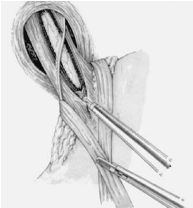
Figure 4. Long myotomy along the anterior, midline of the esophagus (from reference #9, with permission).

doplication requires no posterior esophageal dissection, perhaps decreasing postoperative GERD.