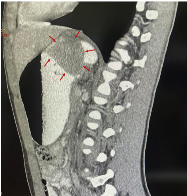
Figure 2 Sagittal view of a computed tomography scan, with oral and intravenous contrast media, showing a cardia-dependent tumor occupying the gastric fundus.

tion with fluorouracil, leucovorin, oxaliplatin, and docetaxel (FLOT). Four months ago, he underwent total gastrectomy, extended with transhiatal resection of the esophagus, and retromesocolic Roux-en-Y reconstruction. After the surgery,