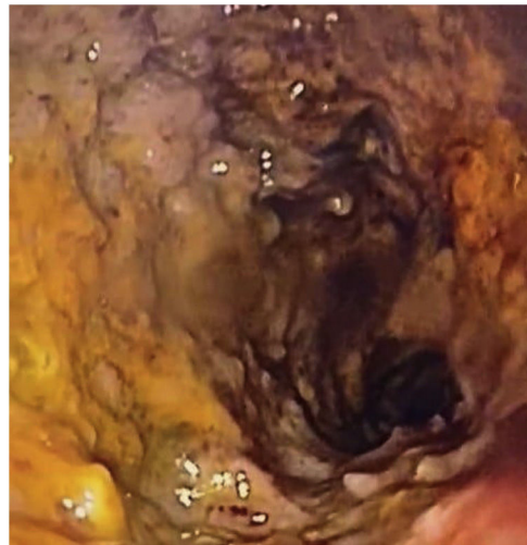
Figure 1 Edematous mucosa with a nodular pattern, erythema, and ulcers of the duodenal bulb can be seen.

vasoactive support (norepinephrine). Severe anemia was reported (Hb: 7g/dl) and he underwent red blood cell transfusion. Contrast abdominal tomography identified generalized distension of the small bowel segments and thickening of the duodenal wall. Panendoscopy revealed severe erosive gastroduodenitis, pseudomembranes, and multiple inflammatory pseudopolyps in the duodenal bulb (Fig. 1). The histologic study reported severe gastroduodenitis due to Ss (Fig. 2). Management with ivermectin 200 \mu g/kg/day, oral albendazole 800 mg/day, and endove-