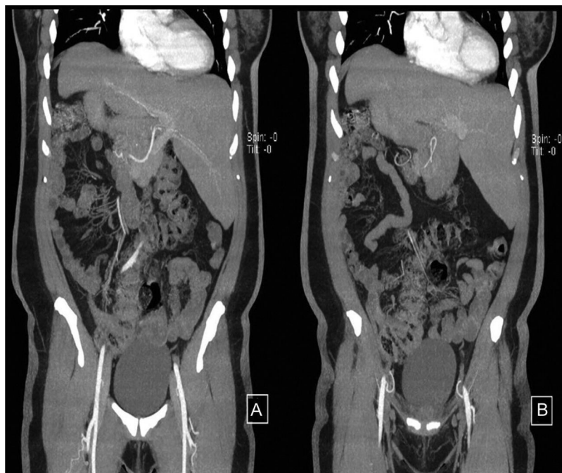
Figure 3 Magnetic cholangioresonance, showing different slices. A and B) Gallstones, catheter in the gallbladder, and abdominal situs inversus totalis are identified.