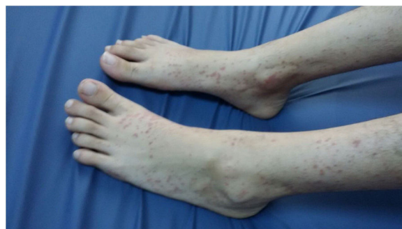
Figure 1 Rash on legs.

Laboratory work-up revealed no thrombocytopenia or coagulation disorder. Serologies for hepatitis A, B, and C, EBV, parvovirus, HSV, and CMV were negative. Protein electrophoresis, cryoglobulin, ASO, rheumatoid factor, serum amyloid A, and C3 and C4 levels were within normal limits. Anti-neutrophil cytoplasmic autoantibody was