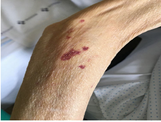
Figure 2 Ecchymosis and capillary fragility in the upper limbs.