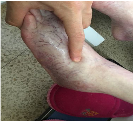
Figure 4 Pitting edema in the perimalleolar region.