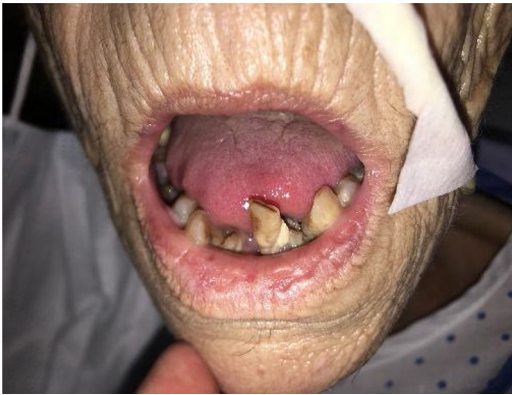
Figure 3 Chronic gingivitis with partial edentulism.