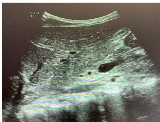
Figure 3 Control ultrasound image before hospital release.

ologic parameters were within the normal range. Physical