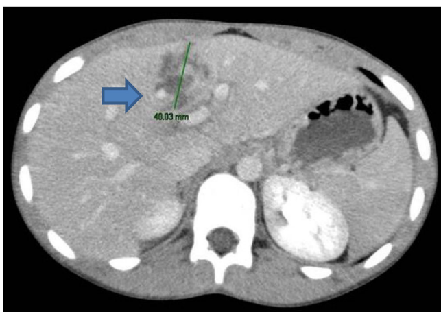
Figure 1 Axial view (CAT) showing the 4 cm laceration in the parenchyma of segment IVb.

A 16-year-old male with an unremarkable past medical and surgical history suffered blunt abdominal trauma after a bicycle accident, in which the upper quadrants of the abdomen were injured by the handlebar. The patient did not lose consciousness. Upon arrival at the emergency department he was hemodynamically stable, and his physi-