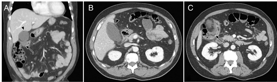
Figure 1 A. Coronal view, the presence of pericholecystic inflammatory changes (arrowhead) and a pericolonic phlegmon (arrow), B. Axial view, perivesicular inflammatory changes, fat stranding at that level, data that could suggest acute cholecystitis, C. Axial view, thickening of the colonic wall of the hepatic flexure and pericolonic fat stranding, with active diverticular disease.