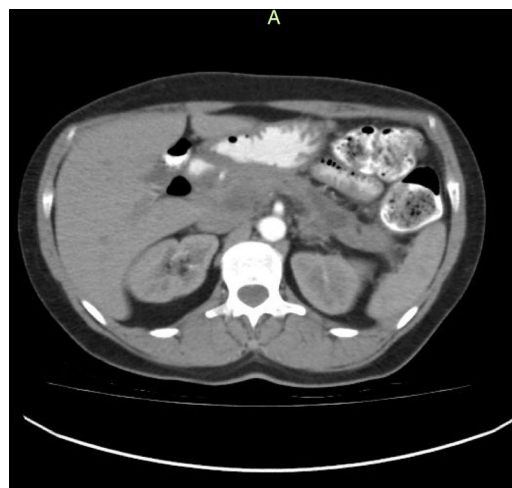
Figure 3 Control contrast-enhanced abdominal tomography scan, 3 months after the event, showing a decrease in edema and inflammatory pancreatic involvement, as well as a single residual collection with no radiologic signs of associated superinfection. The patient was completely asymptomatic when the scan was taken.

Superinfected walled-off necrosis has traditionally been managed through exploratory laparotomy, open abdomen, successive lavages, and necrosectomy. 8,9 The combined management with catheters and drains enables continuous lavage and necrotic tissue debridement with good success rates. 7-10 Nevertheless, those procedures have high rates of morbidity and mortality, producing complications such as bleeding, evisceration, and intestinal fistulas, among others. 5-7 In recent years, the development of minimally invasive techniques has made a single surgical concept possible, with less morbidity. The use of percutaneous drains carried out by an interventional radiologist is a method that has achieved patient improvement, partly associated with the fact that it is minimally invasive. It has the disadvantage of not being able to remove the abundant necrotic tissue in an extensive walled-off pancreatic