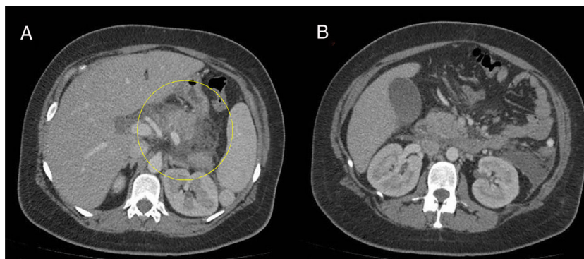
Figure 1 A and B The image shows the edematous pancreas with no necrosis, surrounded by a non-encapsulated fluid collection. The size and morphology of the liver, spleen, and both kidneys are normal. The size of the gallbladder is normal, with no cholecystitis or signs of stones.