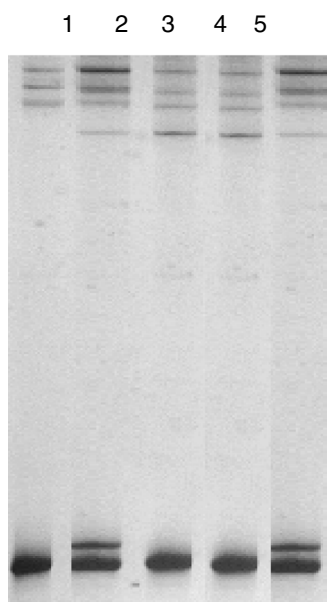
Figure 2 Single-stand conformation polymorphism (SSCP) of exon 3 of the ATP7B gene in two positive controls for the p.L456V polymorphism visualized in an acrylamide gel at 12.5%. The ladders correspond to 1: conformational change a , normal variant, negative control; 2: conformational change b , heterozygous control for the p.L456V polymorphism (C-1); 3: conformational change c , homozygous control for the p.L456V polymorphism (C-2); 4: conformational change c , homozygous for the p.L456V polymorphism; 5: conformational change b , heterozygous for the p.L456V polymorphism.