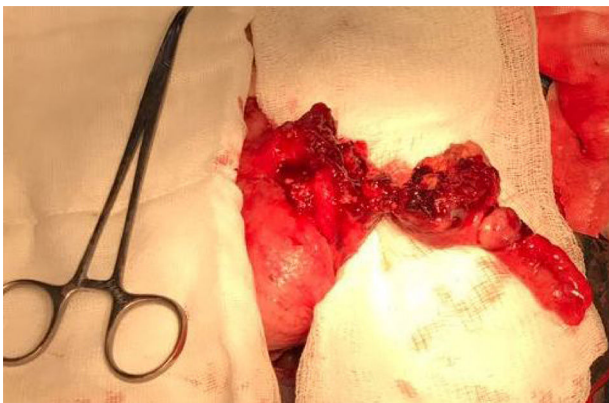
Figure 2 Appendiceal tumor with infiltration into the cecum.

Exploratory laparotomy revealed a tumor that was dependent on the cecal appendix at its middle and distal third, measuring approximately 5 x 3 cm. It had an irregular appearance and was friable and bloody (figs. 1 and 2). Appendectomy was performed with primary closure employing the modified Pouchet technique. The patient was released on the following day with no complications.