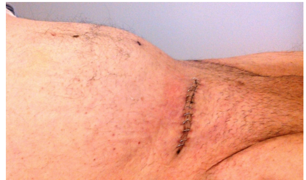
Figure 5 Scar from right inguinal incision 8 cm in length in the patient with previous inguinoscrotal hernia.