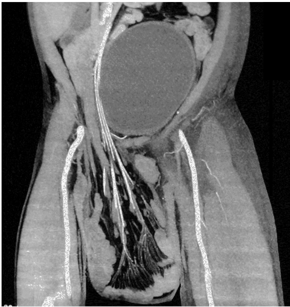
Figure 2 Coronal view of abdominal angiogram scan showing small bowel segments in the extra-abdominal hernial sac, with no vascular involvement, and a full bladder.