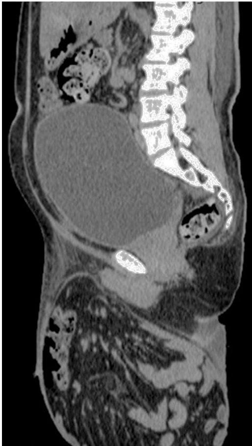
Figure 3 Sagittal view of abdominal tomographic image showing full bladder and small bowel segments in a giant extra-abdominal hernial sac.