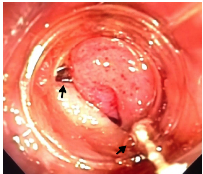
Figure 2 Placed clip (arrows show the ends of the clip).

The OTSC® system is an alternative to the surgical treatment of iatrogenic gastrointestinal perforations. Complications and the mortality rate related to its use are unknown. Surgical treatment should be considered when the OTSC® fails, the perforation is recognized late (> 24 h), or the patient shows signs of a systemic inflammatory response. 8