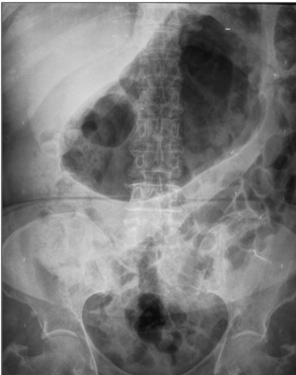
Figure 3 Complementary abdominal x-ray showing the important dilation of the gastric chamber, but the caliber of the bowel segments and the thickness of the walls are normal.

The exact causes of gastric dilation are not fully understood. This condition has been seen in cases of eating disorders, hiatal hernia volvulus, electrolyte abnormalities, superior mesenteric artery syndrome, and trauma. 1 The present case was a patient that developed gastric dilation secondary to trauma, which according to present theories, is explained by compression of the celiac ganglion causing an inhibitory vagal reflex, thus conditioning the gastric chamber dilation. 2