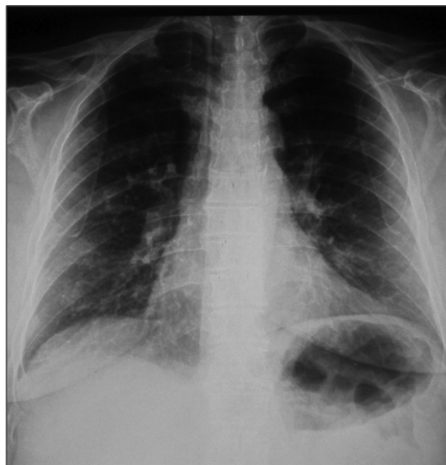
Figure 1 Initial chest x-ray within normal parameters.

A 65-year-old woman had a past history of diabetes mellitus of 14-year progression, high blood pressure since 2006, and diabetic neuropathy. For the last year, she presented with postprandial fullness and burping that improved with metoclopramide. On June 26, 2012, the patient became dizzy and fell, resulting in trauma to the left hypochondrium and the last costal arcs. She began to have intense pain at that site and limited respiratory movements. Chest x-ray was normal (fig. 1). She received diclofenac but did not improve. A rib fracture was suspected and blockade was performed. The pain persisted and 2 days later she presented with predominantly left upper abdominal bloating, increased pain, and abundant burping, and so she went to the emergency department. Physical examination revealed BP 125/80, HR 88/min, left basal hypoventilation, asymmetric abdomen with important distension in the epigastrium and left hypochondrium. She had pain upon palpation and tympanism, negative decompression, and peristalsis was present. Laboratory work-up reported: Hb 11.6 g/dl, leukocytes 8400/mm 3 , glucose 193 mg/dl, platelets, serum urea and creatinine, electrolytes, amylase, lipase, and CPK were normal. ECG was normal. Plain abdominal x-ray (PAX)