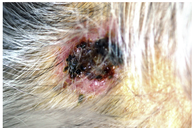
Figure 1 Scalp nodule.

and CA-19-9 436 IU/ml (normal limit < 37 IU/ml). An abdominal CT scan showed a mass located in the uncinate process of the pancreas that conditioned dilation of the common bile duct and duct of Wirsung. Peritoneal, pulmonary, and paravertebral muscle lesions suggestive of metastasis were also observed. Due to these findings, endoscopic ultrasound fine needle aspiration of the pancreatic mass was performed. The scalp biopsy (fig. 2) revealed the presence of cutaneous metastases with morphologic and immunohistochemical characteristics consistent with a pancreatic origin (positive for cytokeratins 7 and 19 and negative for