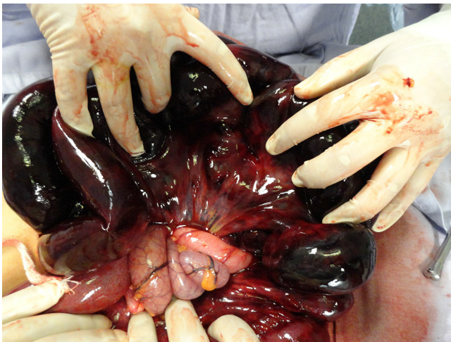
Figure 2 Photograph showing the torsion site of the ileal volvulus.

and their vessels twist around an obstruction point, creating a “swirling” of soft tissue strands within mesenteric fat attenuation. 6,7 This sign and the medial deviation of the cecum and descending colon are useful in diagnosing double volvulus. 8