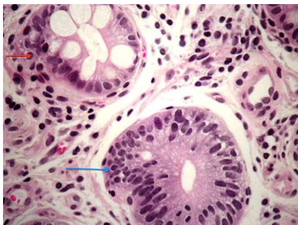
Figure 2 Blue arrow: Low-grade gastric mucosal dysplasia. Loss of polarity of the basal nuclei showing a pseudostratified pattern with nuclear pleomorphism and hyperchromasia (hematoxylin and eosin stain) Red arrow: Gastric gland. Intestinal metaplasia.

An Olympus GIF-180 gastroscope was employed. Indigo carmine at 5% was applied to define the margins of the lesion by contrast. An endoscopic Flex Knife® was used to mark the circumference of the lesion with monopolar energy (cut 70/coagulation 30); the submucosa was infiltrated with 3 cc of saline solution at 0.9% and 1.5 cc of hyaluronic acid using an injector (Olympus NM-200U0423). The circumferential cut of the lesion was made with the endoscopic Flex Knife and the submucosa was dissected with the IT Knife2®, until the lesion was completely resected (Fig. 2).